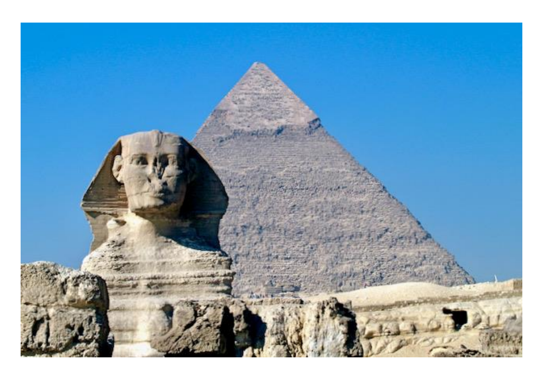
Probably not constructed as a result of a Bipartisan Infrastructure Bill!